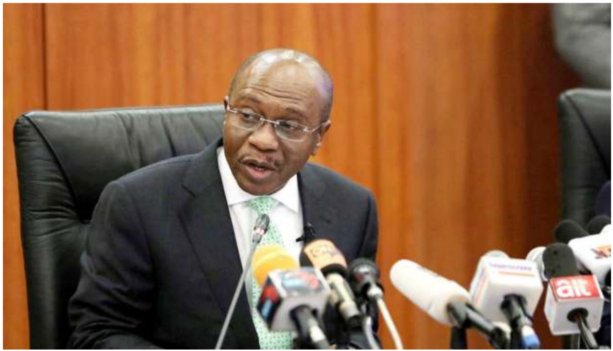
Governor Emefiele addressing the press

he Central Bank of Nigeria (CBN) has unveiled guidelines for Non-Interest Financial Institutions under its Agri-business, Small and Medium Enterprise Investment Scheme (AGSMEIS), Micro, Small and Medium Enterprises MSMEDF), the Accelerated Agricultural Development Scheme (AADS) and seven other intervention schemes in its bouquet.