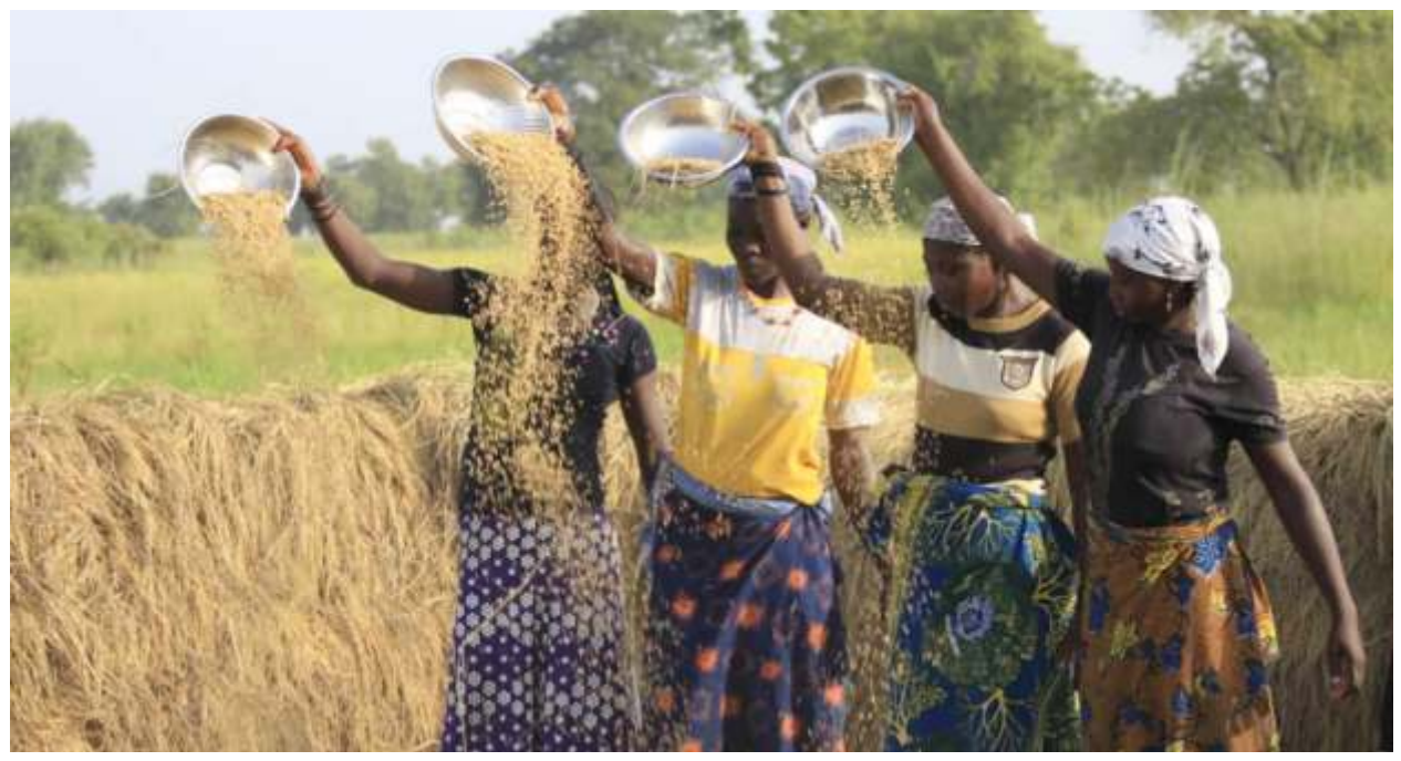
Manual winnowing of threshed rice

he Central Bank of Nigeria (CBN) in a bid to create an impact that would guarantee food security in the country is set to provide funding through the Anchor Borrowers' Programme (ABP) to about 1.6 million farmers of 10 commodities across the country for the 2020 wet season.