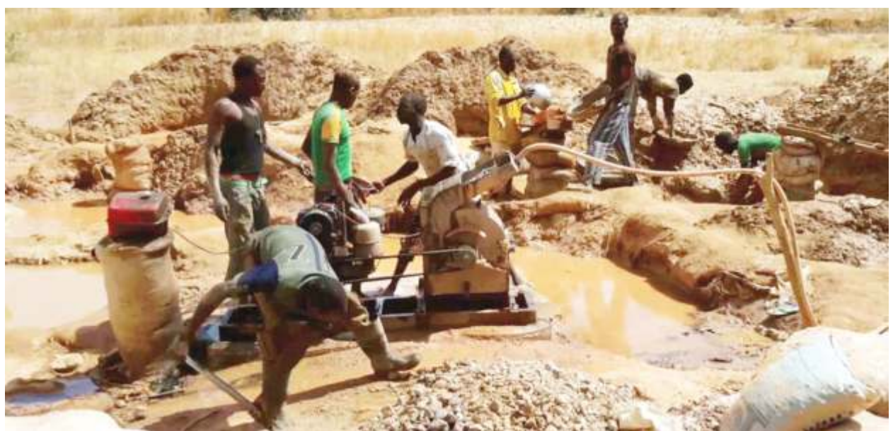
Miners at work

n its determination to boost production in the economy and create jobs for the teeming population, the Central Bank of Nigeria (CBN) is geared to develop a Gold Purchase Framework under the Federal Government's Presidential Artisanal Gold Mining Development Initiative.