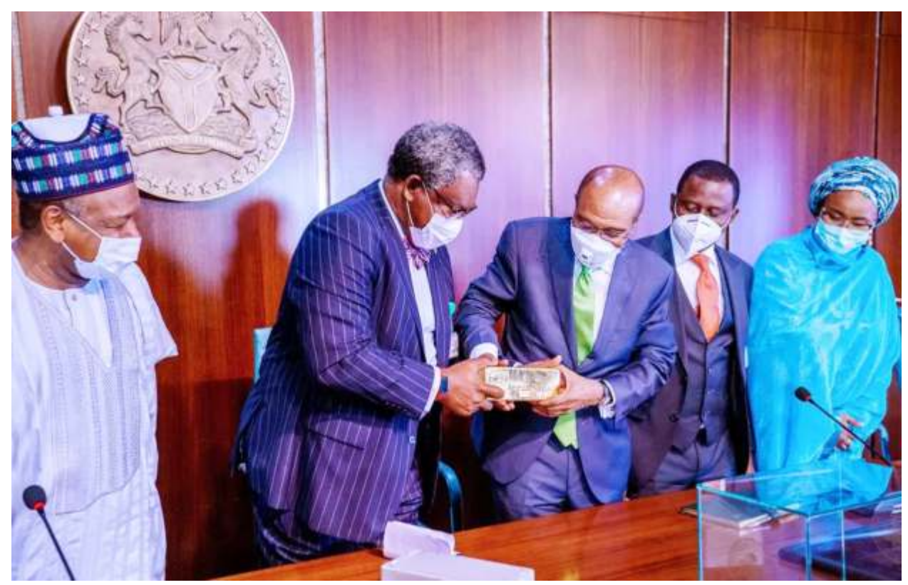
Governor Emefiele and Minister of Mines and Steel Development, Olamilekan Adegbite inspects 12.5kg mined-in-Nigeria gold bar

Also speaking at the event, the Minister of Mines and Steel Development, Olamilekan Adegbite, said that PAGMDI will result in the creation of thousands of new mining and formalized jobs, leading to poverty alleviation for many households.